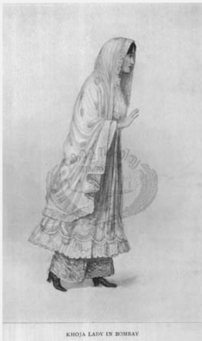
KHOJA LADY IN BOMBAY